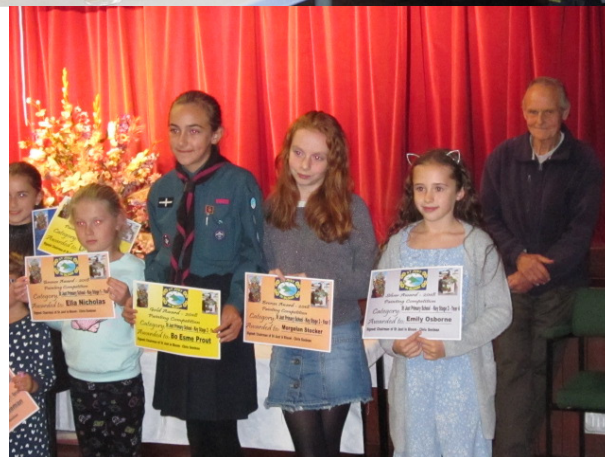
Some of our painting competition winners