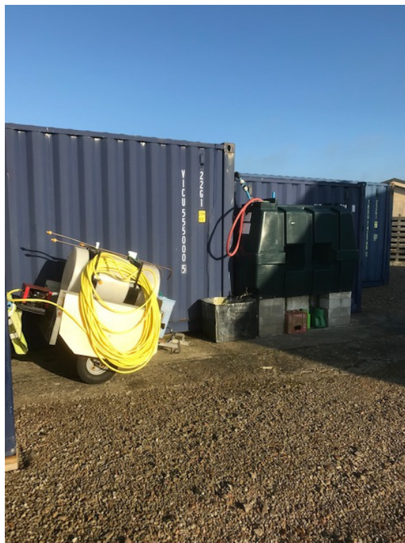
Bowser, hose and new water butt