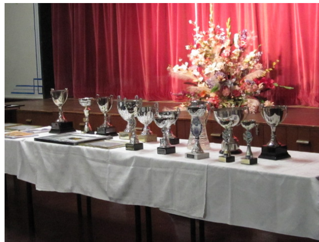
Cups on Display