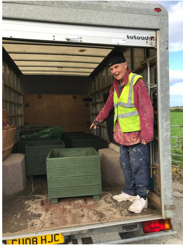
New tubs this year