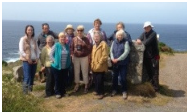
Our sponsored walk