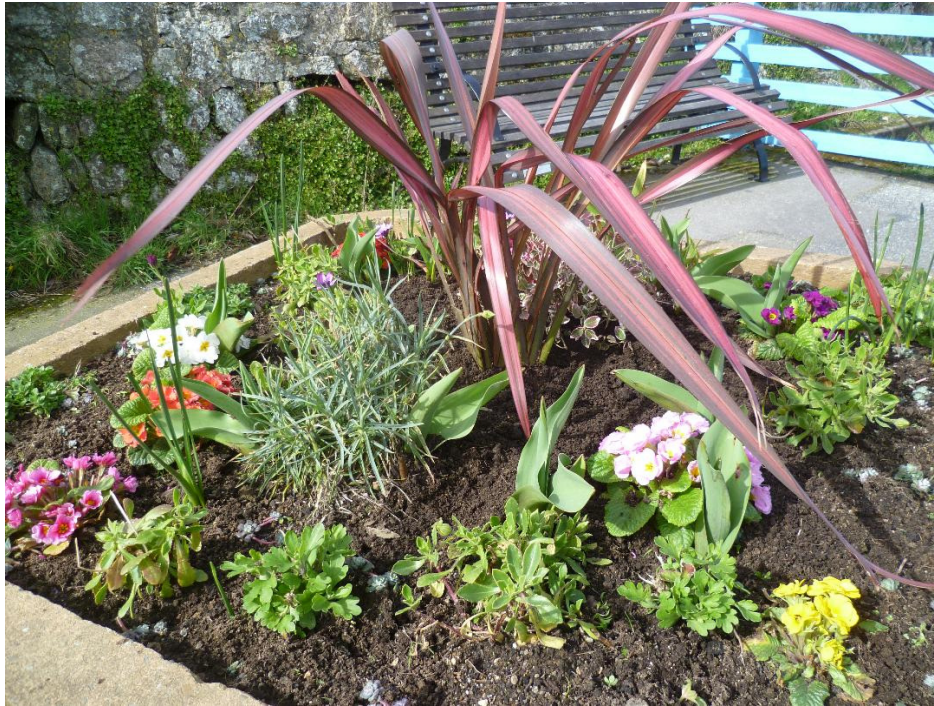
A newly planted tub with sustainable plants