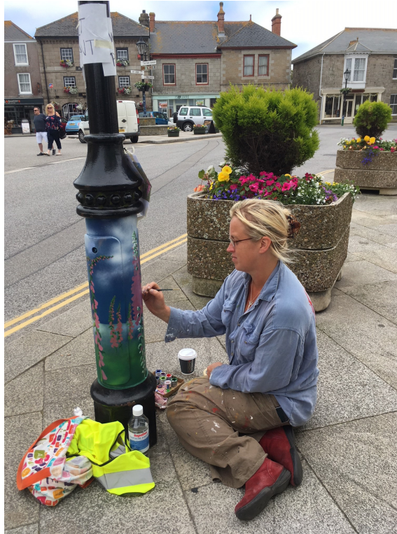
Painting the lamp posts