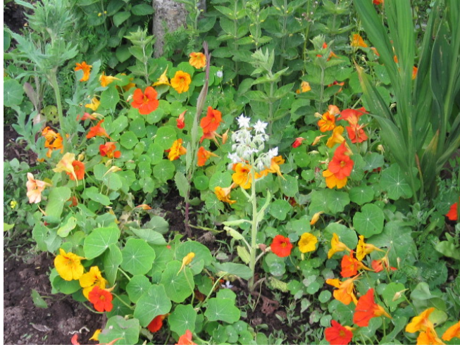
Introducing pollinating flowers around the town