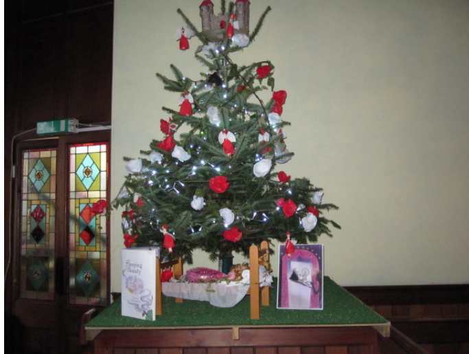
Christmas tree display ‘Sleeping Beauty’