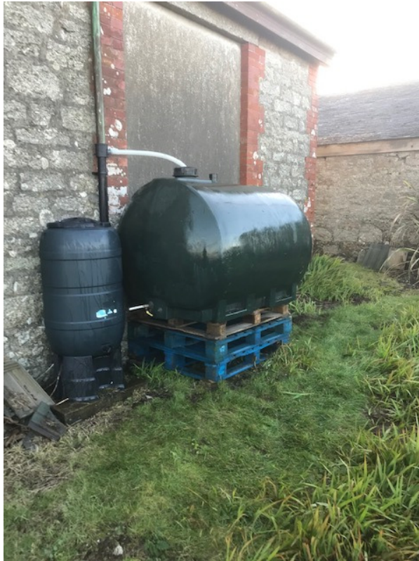
Part of our new watering system