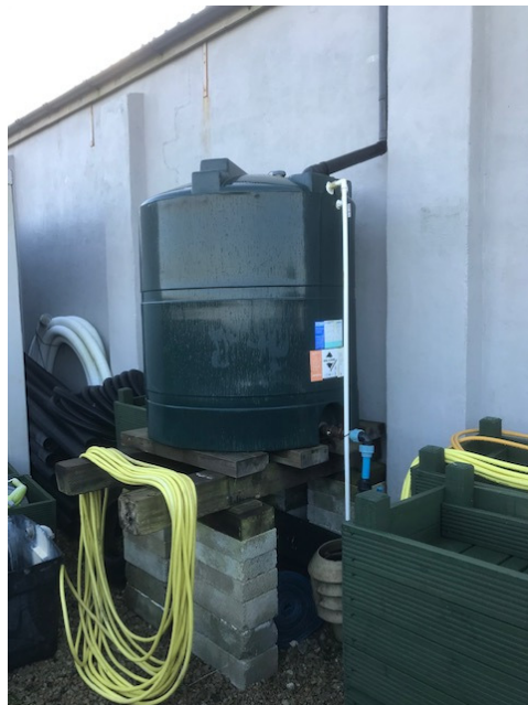
One of four new water butts