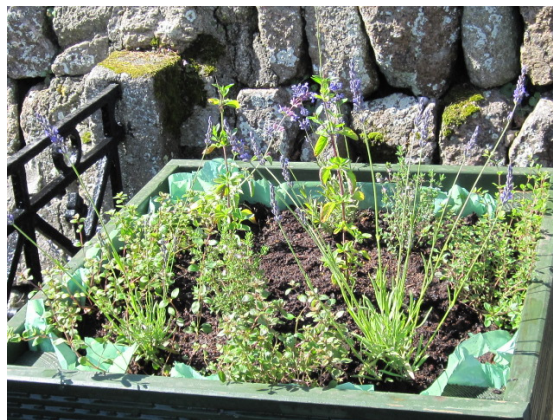
Introducing pollinators in our tubs