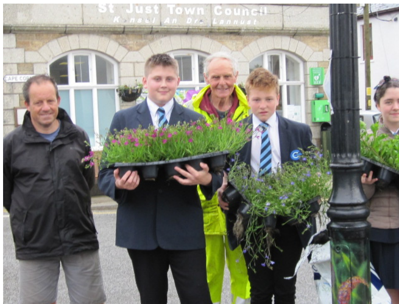
School children involved in the new gardening project