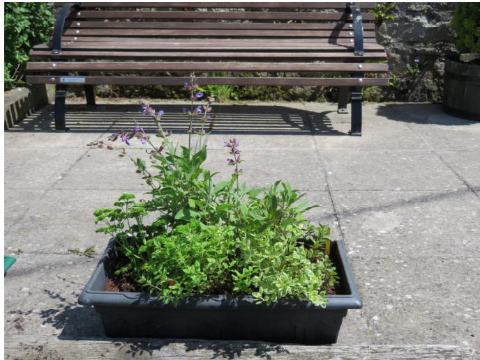
Introducing herbs around the town