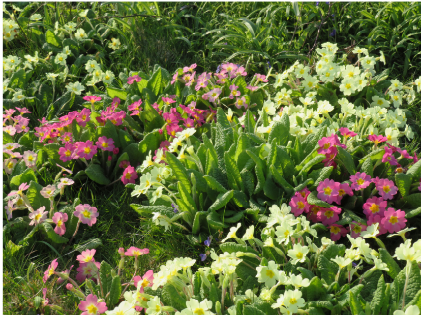
The Cemetery in spring