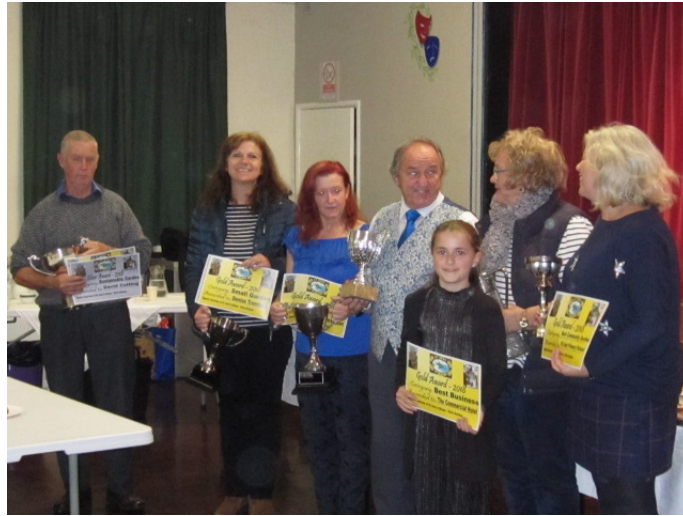
Our garden competition winners