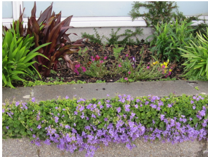
Newly planted border at the Comprehensive School