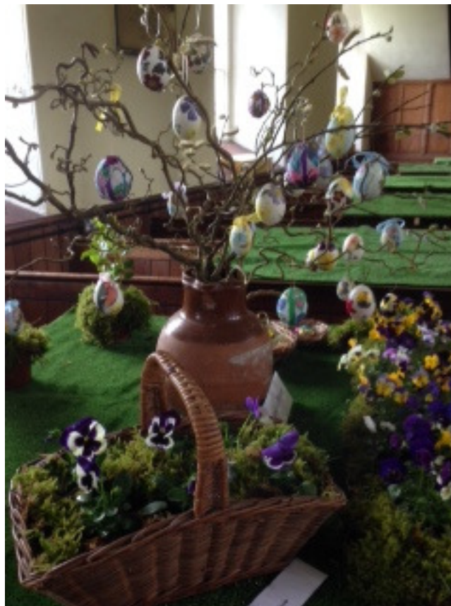
Easter display for the Chapel