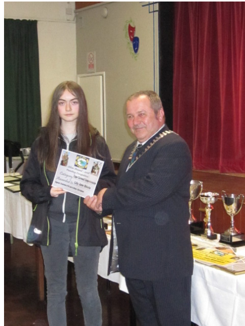
Our Mayor presenting a worthy winner