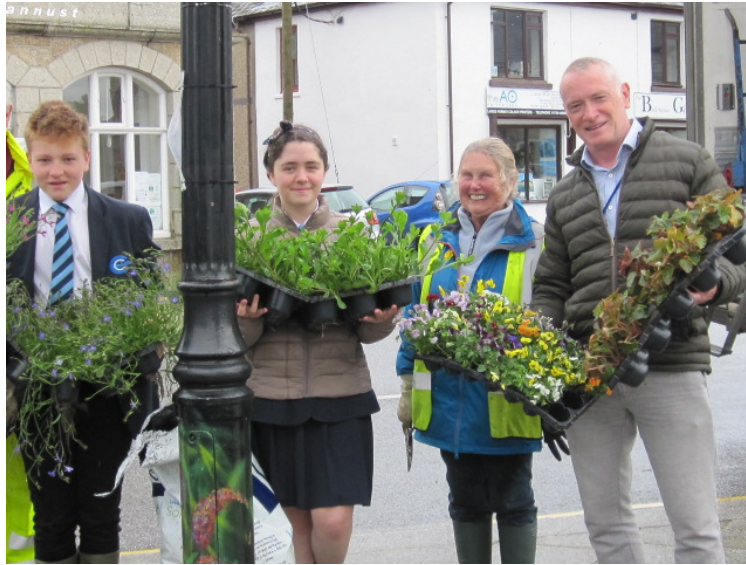
Collecting plants for the Comprehensive school