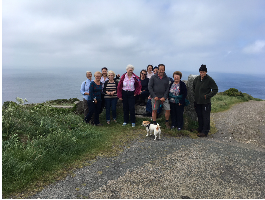
Our Sponsored Walk