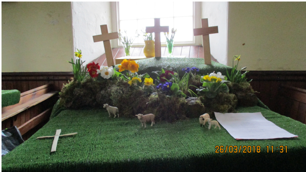
Easter display 'There is a Green Hill Far Away'