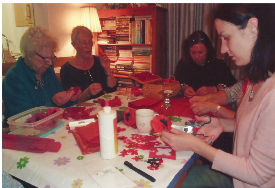
Making the Poppies