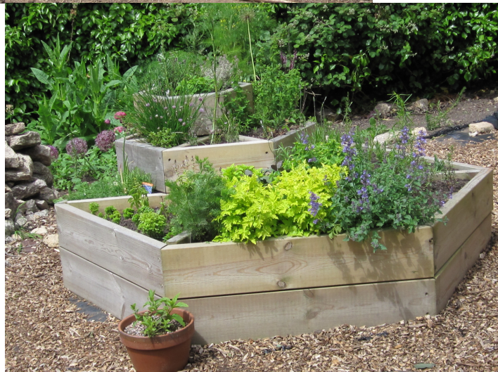
Bosavern Community Farm