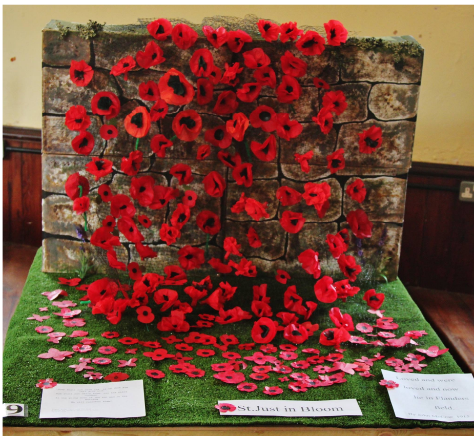
Our display at Miners Chapel for Remembrance