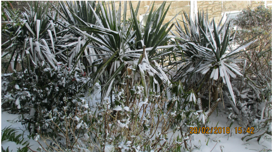
Snow in March