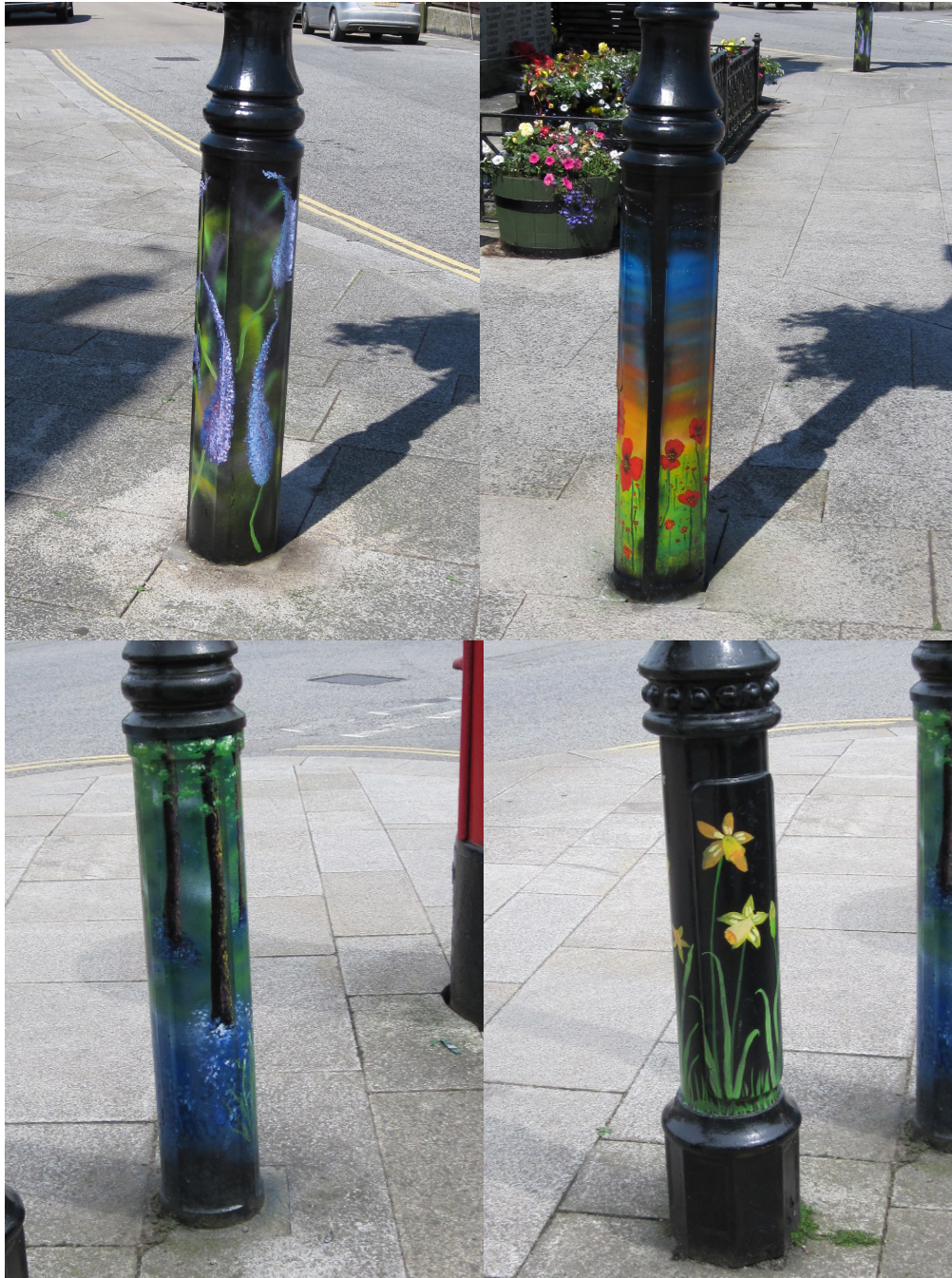
Our Painted Lamposts