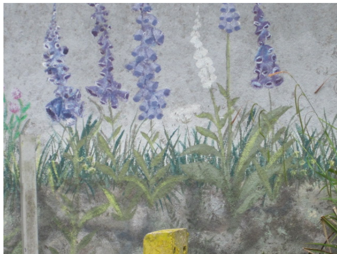
The new mural in Chapel Street