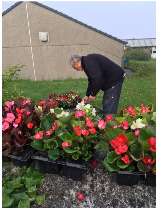
Planting the car park wall