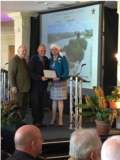
Our Chairman receiving a Gold Award