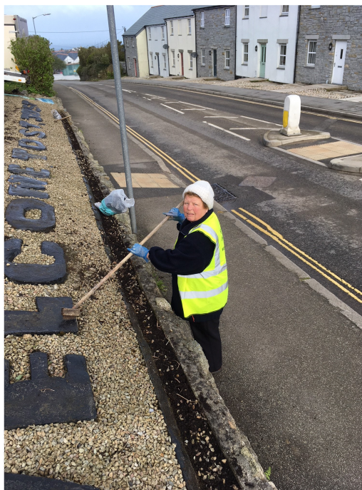
Cleaning and tidying the wall in front of the garage