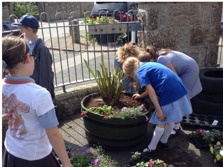
School children helping