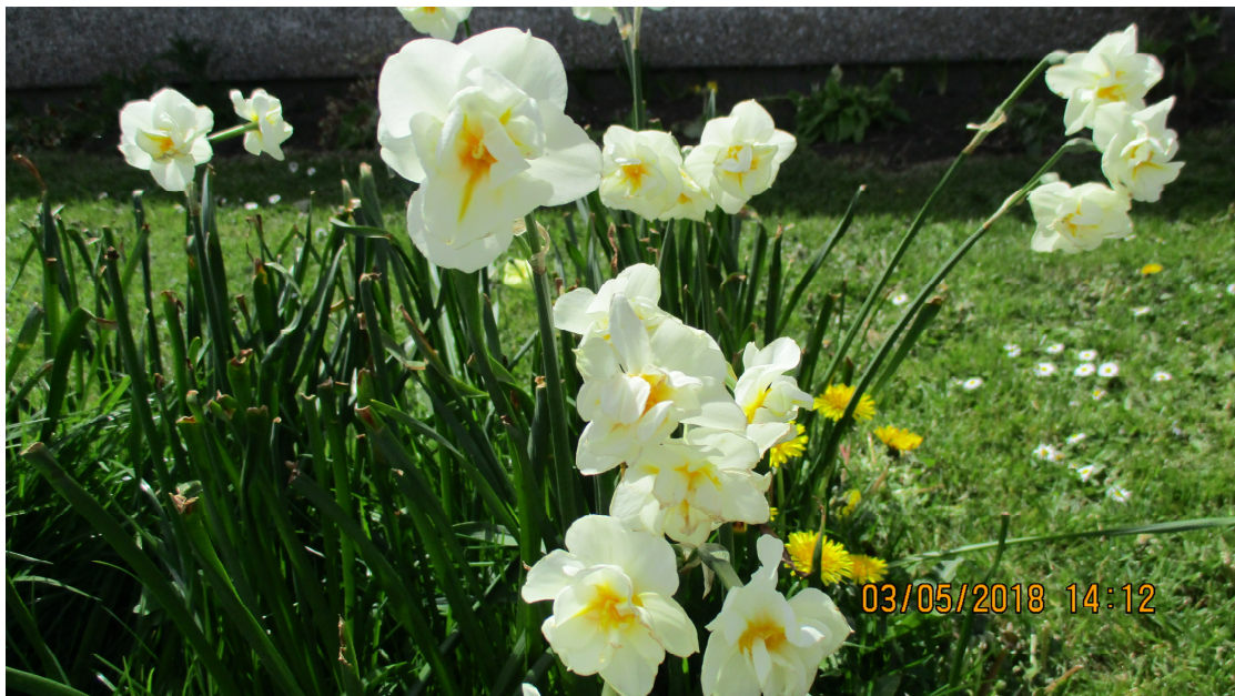
Daffodils around the town in April