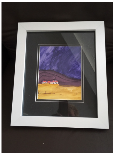
The three paintings which won their categories All from St Just Schools