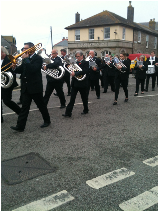
Feast Day Parade