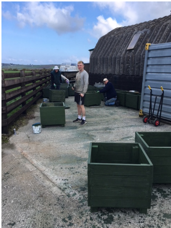
Making and Painting Tubs