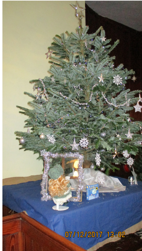
Christmas tree 'Twinkle Twinkle Little Star'