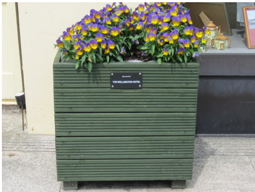
Violas on display