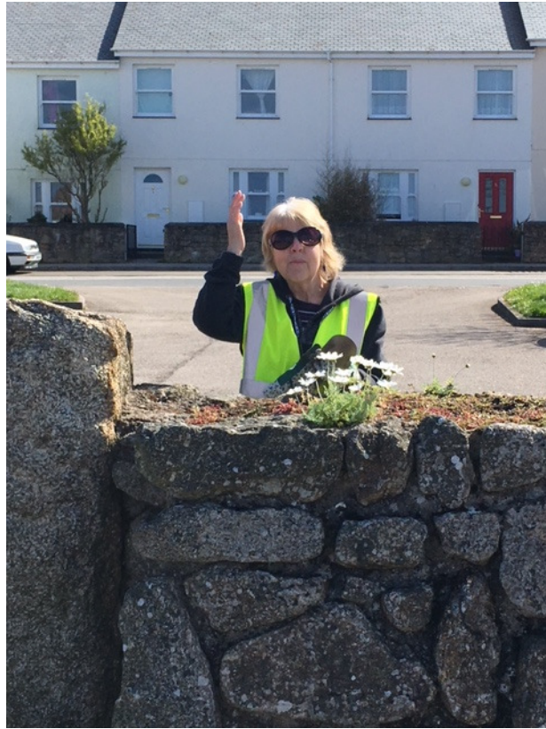
Weeding the car park wall