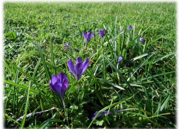
Helping wildlife in the Churchyard